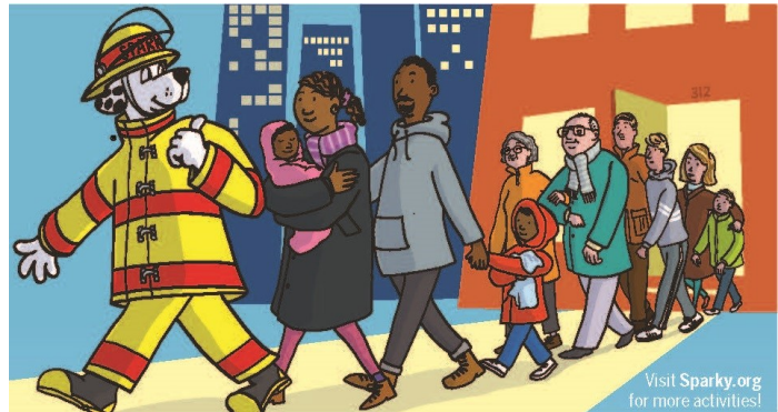
Visit Sparky.org for more activities!

https://www.wintervillenc.com/fire-rescue-ems