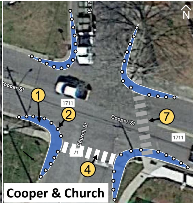
Cooper & Church