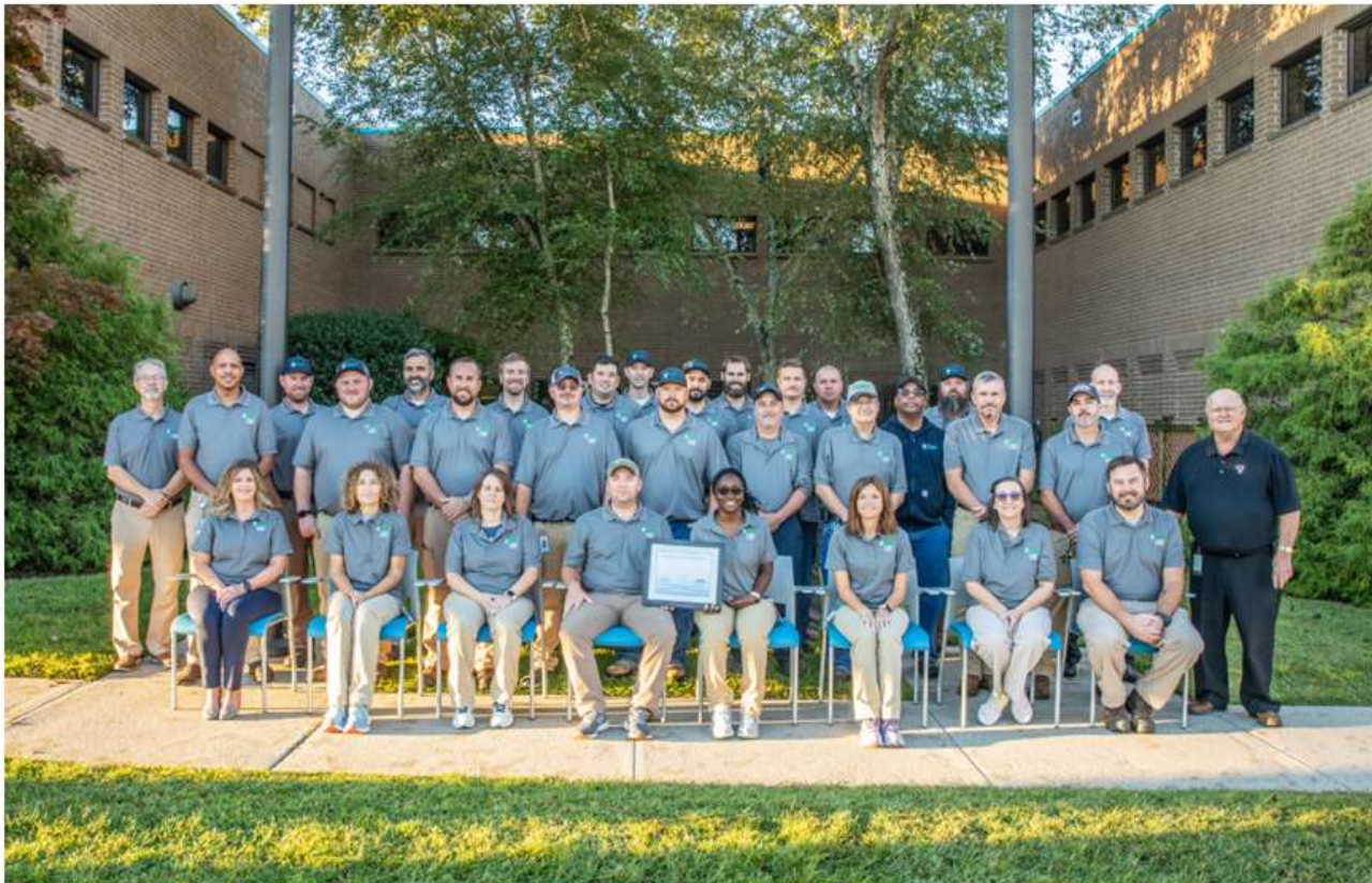
GUC was awarded its 7th consecutive Area Wide Optimization Award and the Partnership for Safe Water Directors Award in 2022.