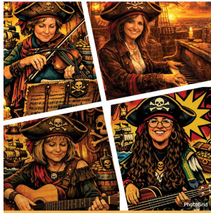
THE BONNIE PIRATES SUNDAY, APRIL 12, 3-5 PM